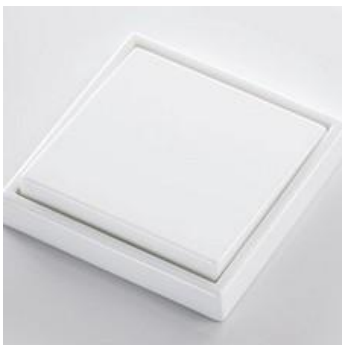
JUNG LS 990 mechanisms in alpine white.

A TV and data socket will be installed in all selected rooms.