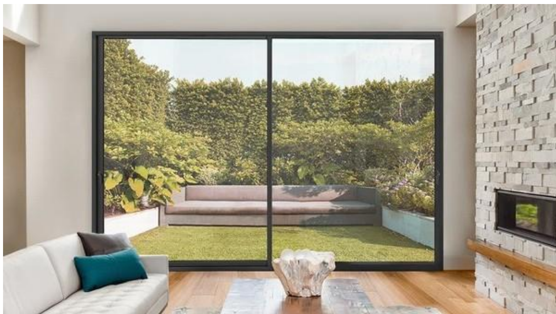
** example photo

All systems have undergone rigorous quality testing at the CORTIZO Technology Centre and in internationally renowned laboratories, thus ensuring a high level of efficiency, durability, and comfort.