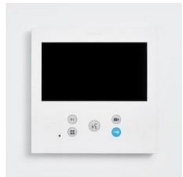
Video intercom from FERMAX or a similar brand.