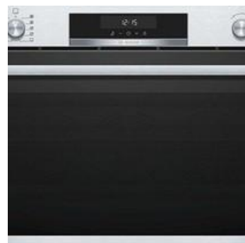
Series | 6 Oven, 90x60 cm, stainless steel.