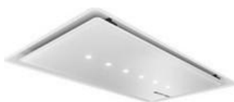
Series | 8 Ceiling extractor, 90 cm, white glass.