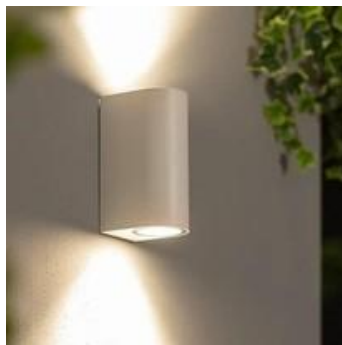
Designer outdoor wall light (example in photo).